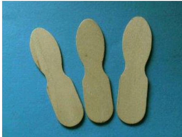
Sample of wooden ice cream spoons