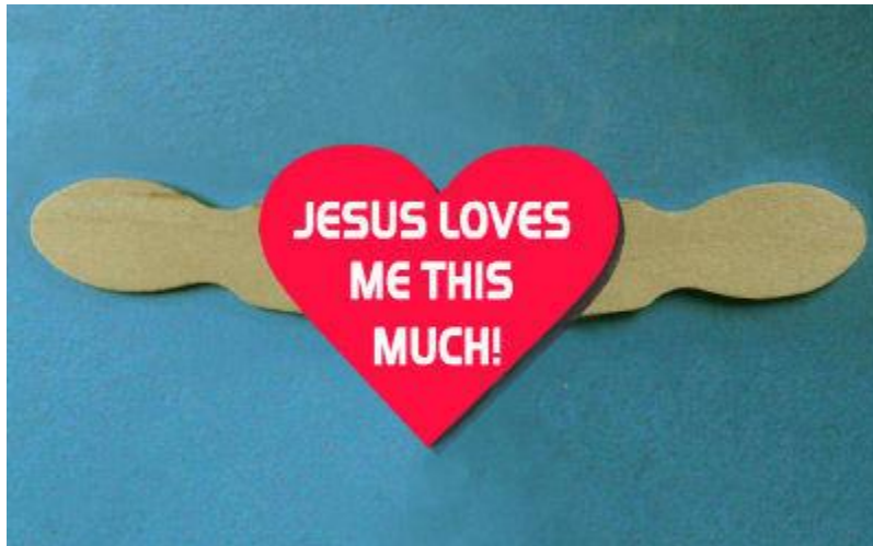
Sample of finished craft